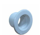
Woody outlet feed-through