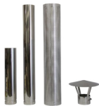
Chimney set 120x1500mmm