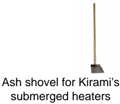
Ash shovel for Kirami's submerged heaters