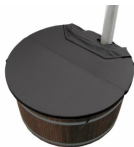
Insulated cover Woody L SUB, 200 cm round