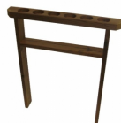
Drink holder / cover strip kit Woody Thermowood